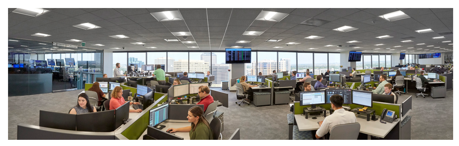
Tenaska Power Services Co. is an experienced power marketer that offers utilities, municipalities, large industrial clients and independent power producers a variety of optimization services, energy management, power trading and settlement services.